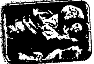
Elementary and High School Educational Assistance

Poverty, we consider as one of the cancer in our society, is the root cause of prostitution in our country. The Philippines. Fighting prostitution is to fight poverty. Mary Queen of Heaven Missionaries established the Foundation, with the help by its own lay members to fully fight poverty through the following programs: